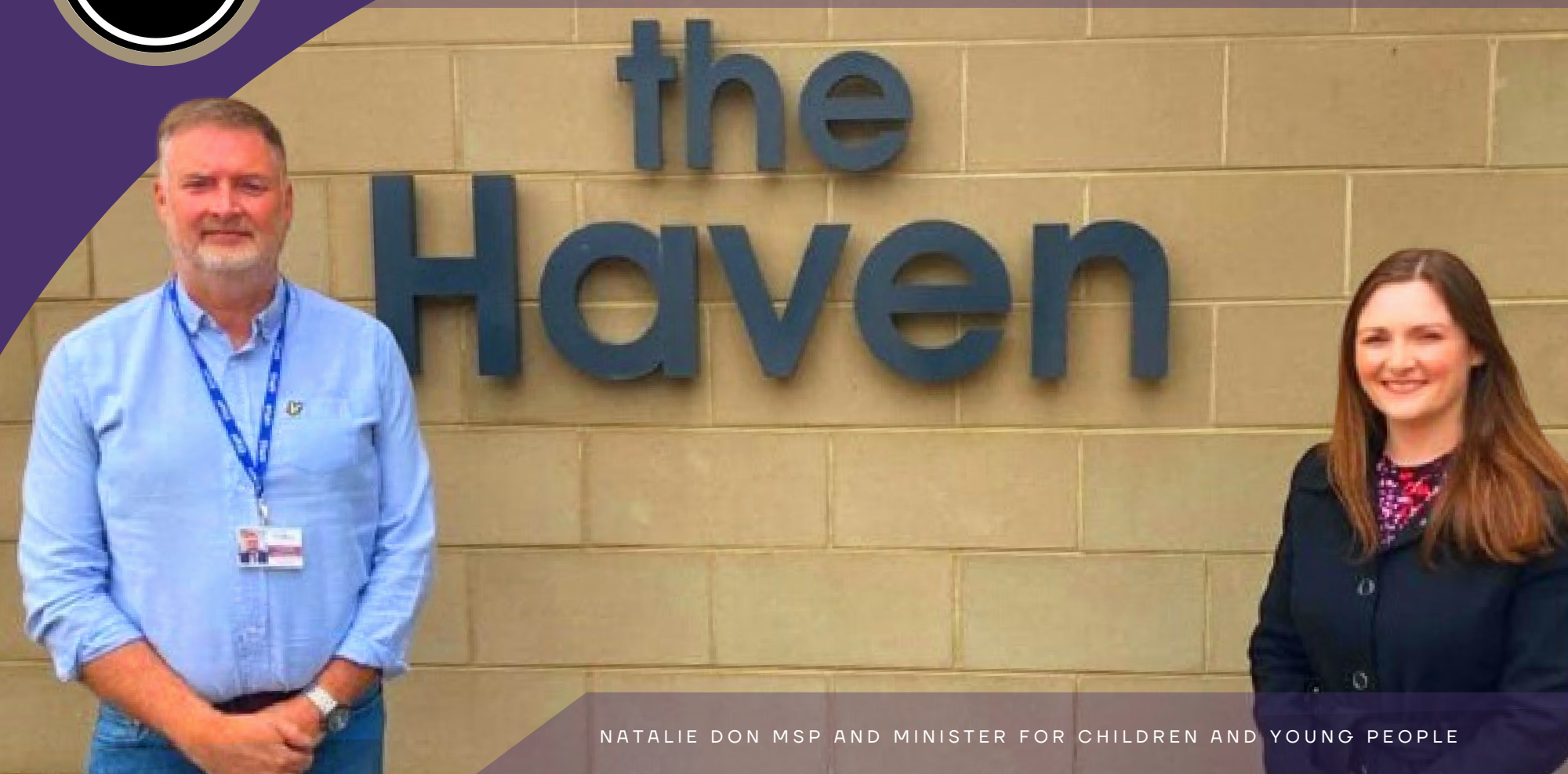
NATALIE DON MSP AND MINISTER FOR CHILDREN AND YOUNG PEOPLE